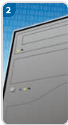
Weather Reach Server