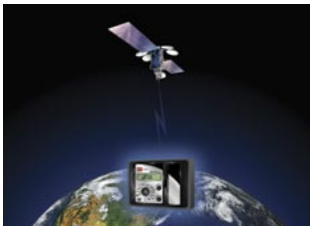
2 Information gathered from weather stations is transmitted through satellites to the Intelli-Sense controller.