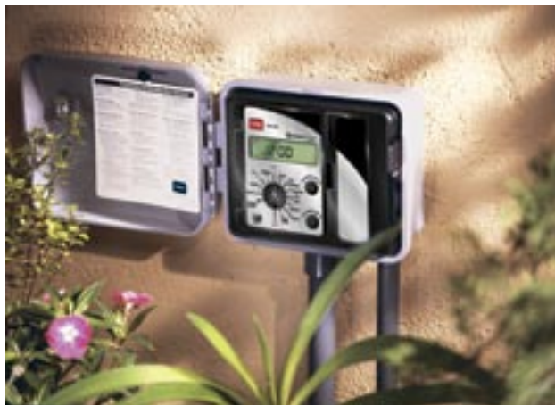
1 Simply enter site-specific conditions upon installation of unit.