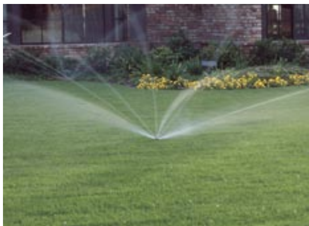
3 Irrigation schedules are adjusted accordingly and precise water amounts are delivered automatically.